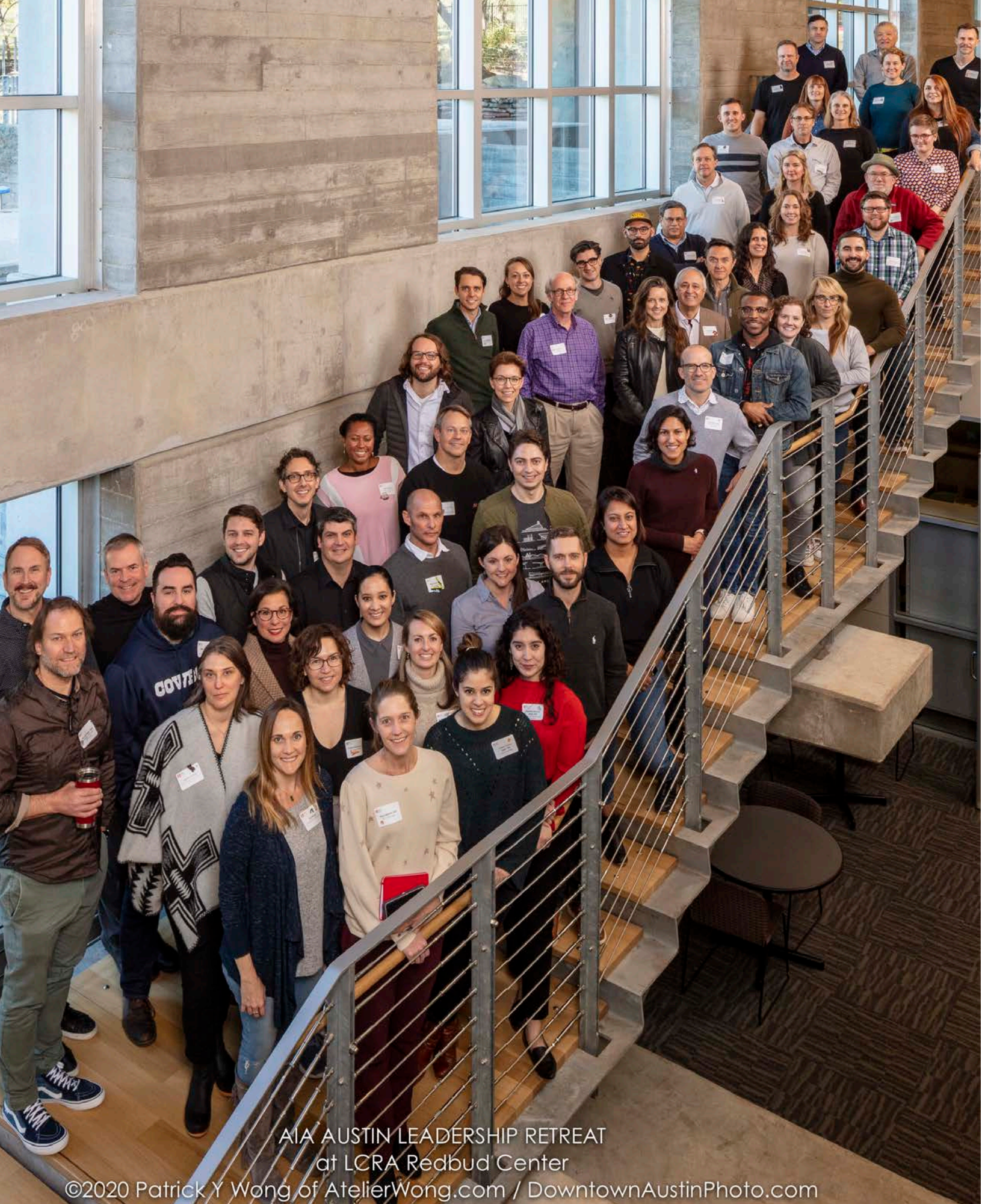
AIA AUSTIN LEADERSHIP RETREAT at LCRA Redbud Center