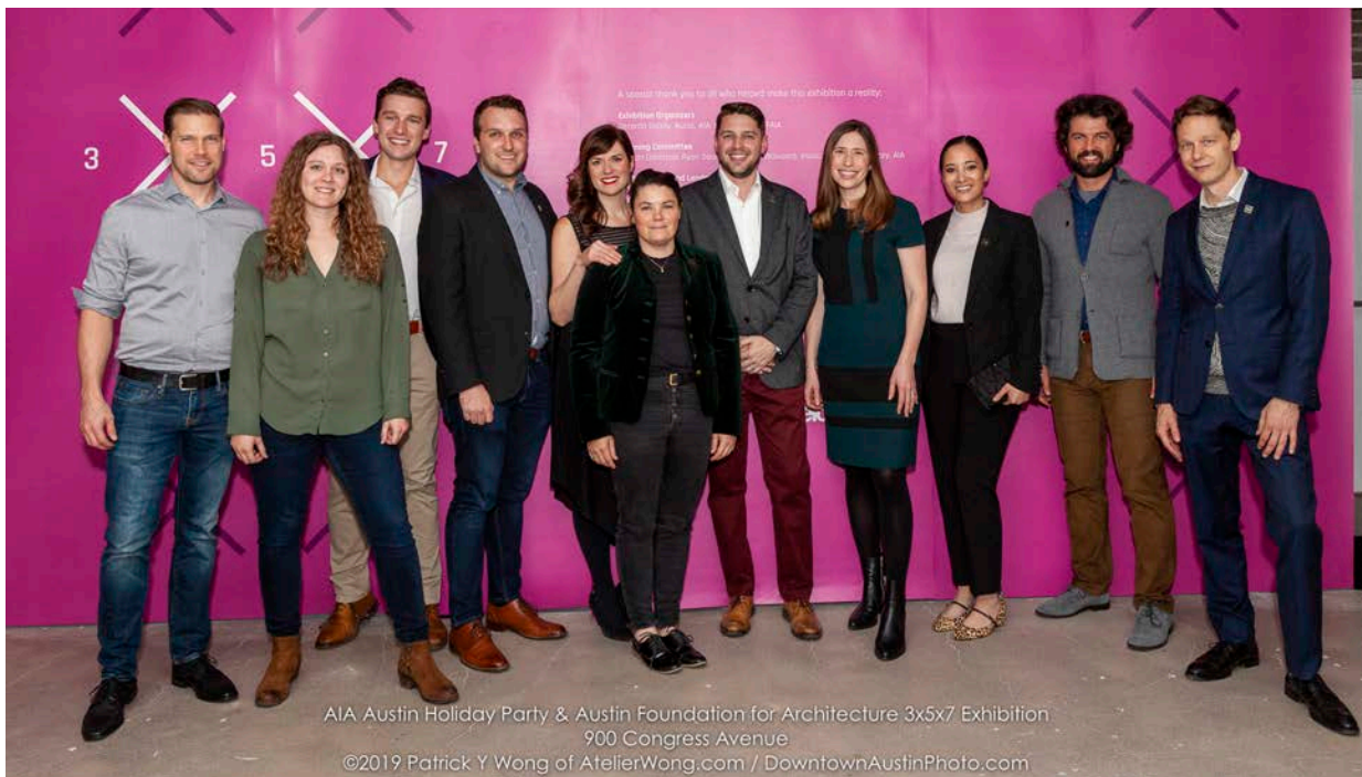
The 2019 Leadership Collective.