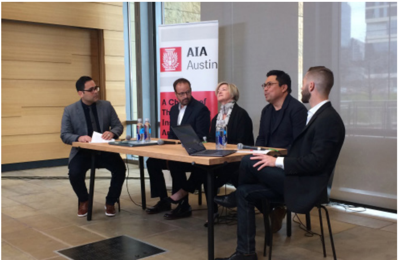
The Small Firms Roundtable panel discussion, “How to Take Over the World,” focused on the successful growth path of recognized local architecture firms.