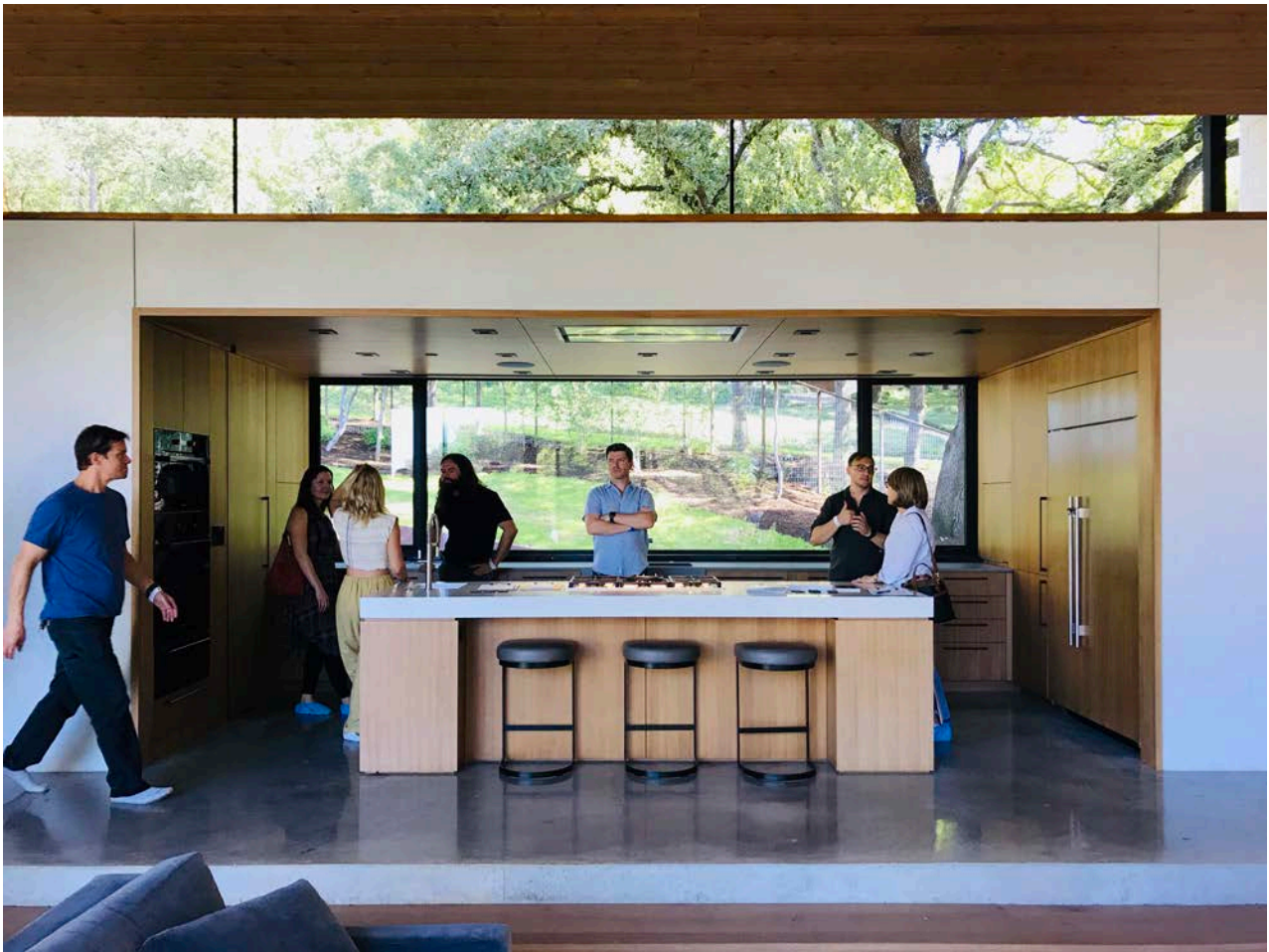
Tour attendees explore a home by Ravel Architecture.