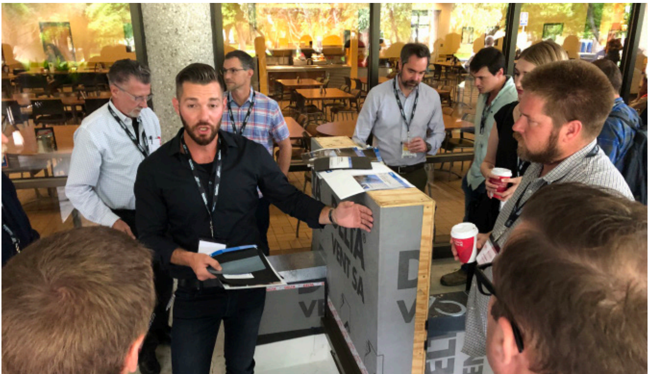
BEC: Austin's 2019 ATX Building Performance Conference focused on how we improve the way buildings are designed and built.